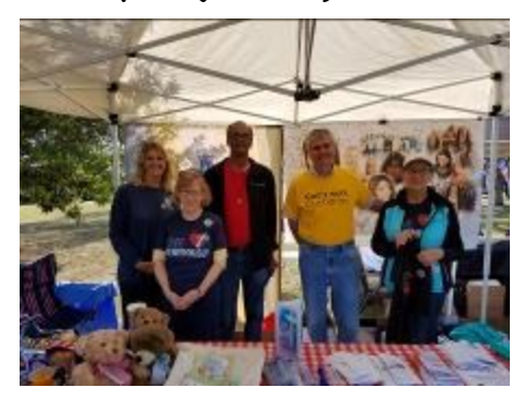
Beer & Hymns