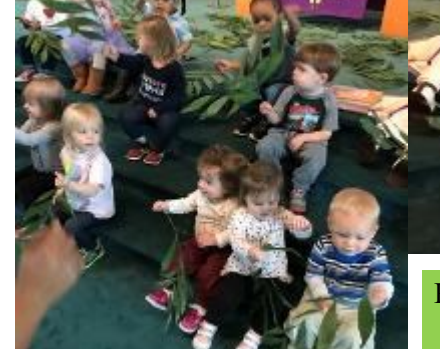
Preschool Children in Chapel learning about Jesus' triumphal journey into Jerusalem! They were shouting "Hosanna" as loudly as they could! Praise God for their JOY!