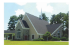
Living Springs Lutheran Church 2016