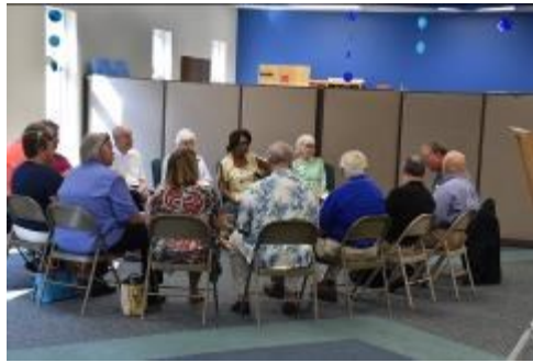
Church Lock Information Session