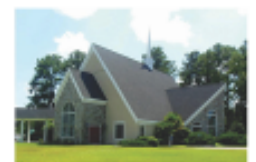
Living Springs Lutheran Church 2016