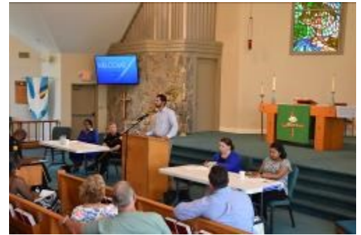
Public Safety Forum