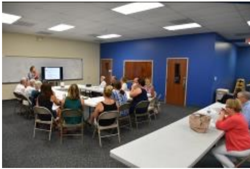
Child & Youth Protection Training