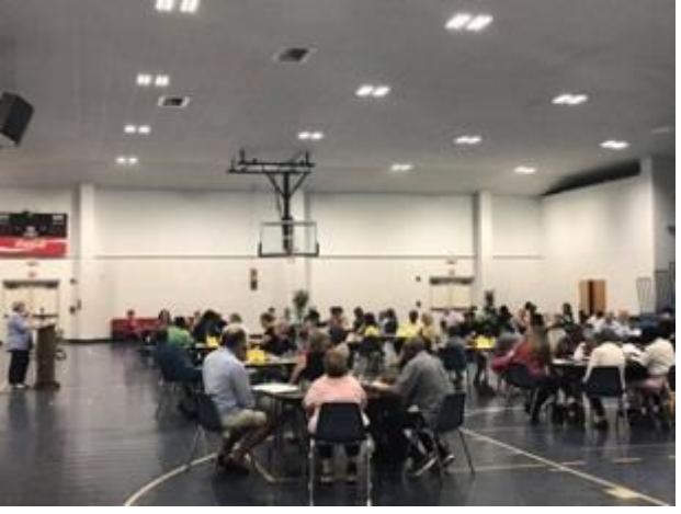
Justice Ministry Team Blessing