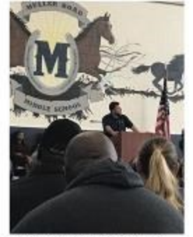
God working through song, words, and a moment of silence we remember all who sacrifice so much

"Devotion in Motion" class opening with prayer at Jeep Rogers Family YMCA, Lake Carolina