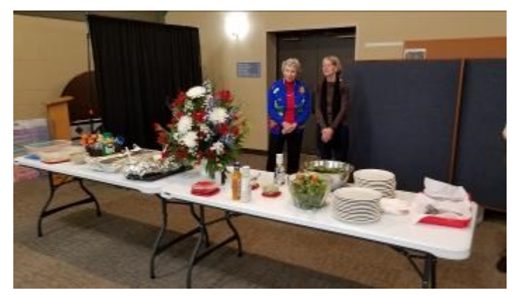
VA Ministry Night - Disciples of Harmony