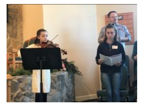
Christ the King Sunday/Commitment Planting

Thank you to all Beer and Hymns band members for sharing your God-given amazing talents with us every month at Beef O'Brady's. Our community is blessed to experience the joy of music that you bring into our lives.