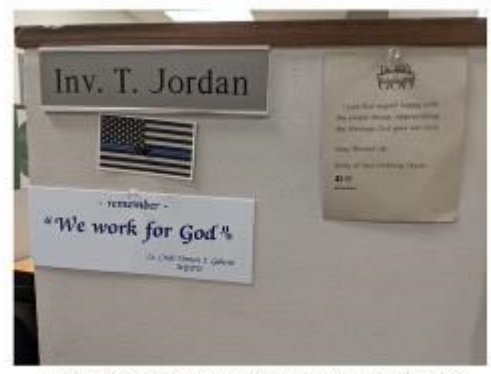
God at work keeping those safe who protect us from those who would do us harm.