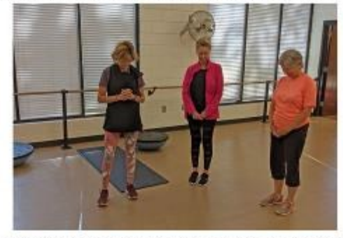
"Where 2 or 3 are gathered in my name there I am with them..." (Matthew 18:20)

"Devotion in Motion" class opening with prayer at Jeep Rogers Family YMCA, Lake Carolina