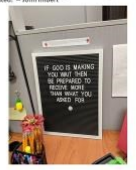
God working through people working in Law Enforcement