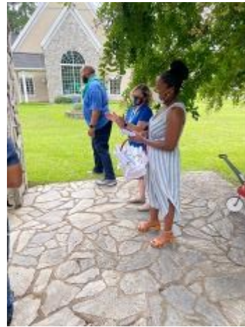
Graduation/ Kindergarten Kickoff