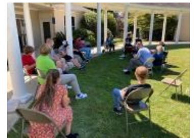
Sr. Youth House Gathering

~Online Make-up session: Sun., Oct. 10, 6pm: Click here for Sun. 10/10 Make-up session or call: +1 323-515-9597 PIN: 776209519#