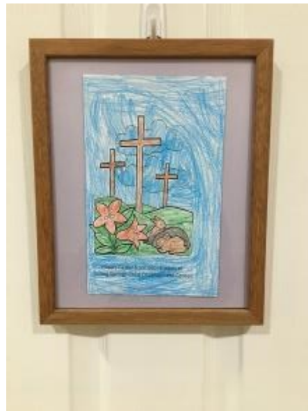
One of the LS Child Development Center's cards was framed by a resident and put on their door!

Thank you so much for thinking of Rice at Easter. The eggs was so cute and the candy was good. Hope we can come out for dinner some time soon.