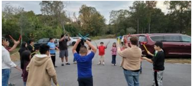
We marched to "Oh when the Saints come marching in" in the parking lot